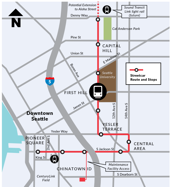
First Hill Streetcar

The First Hill Streetcar fleet consists of six, 66-foot-long modern streetcar vehicles. The cars draw traction power from an overhead contact system providing 750 volts of direct current, and operate with power from an on-board energy-storage system. Each car seats 30 passengers and accommodates another 40 standing passengers. Two wheelchair passenger locations are in the standing area.