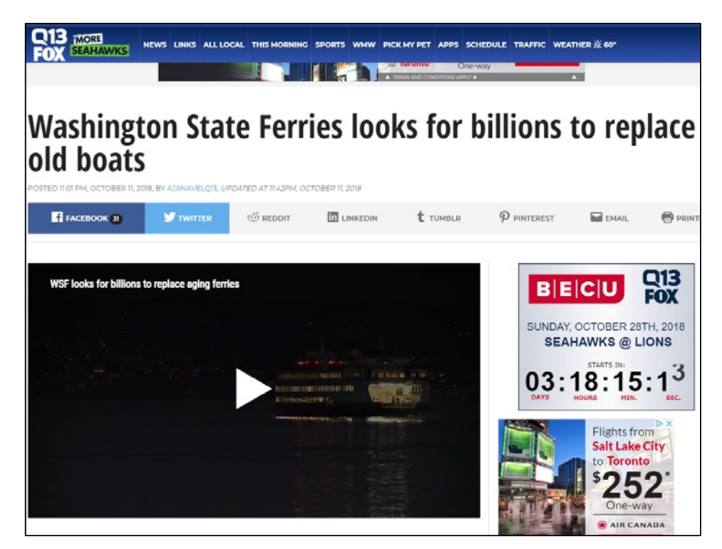
Article from Q13