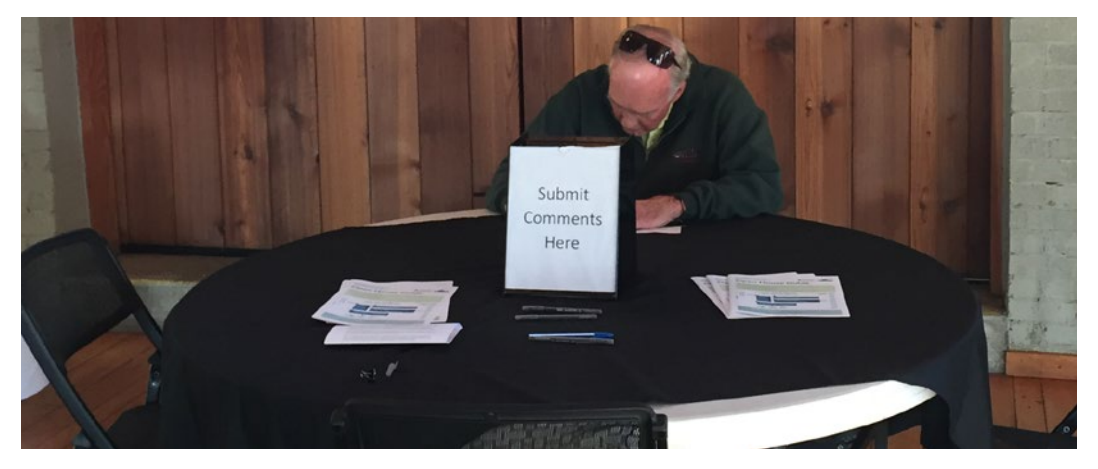
Fall 2018 Community Engagement Summary | November 2018