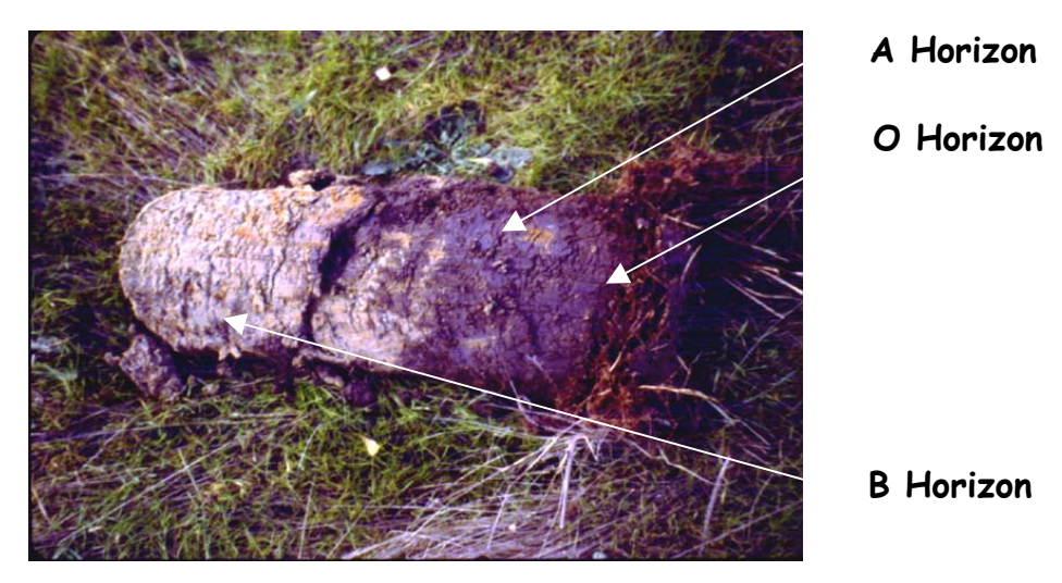
Figure 700.1 Soil Horizons

soil organic matter The fraction of the soil that includes plant and animal residues at various stages of decomposition, cells and tissues of soil organisms, and substances synthesized by soil organisms.<sup>10</sup>